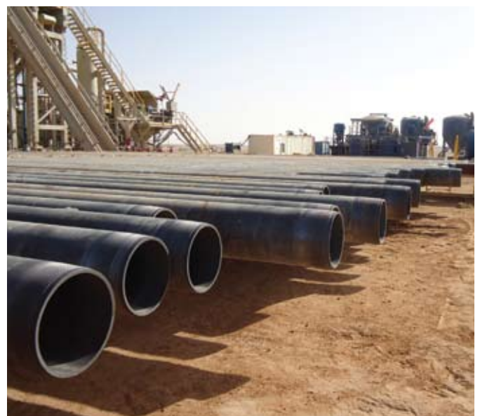
▲ TenarisHydril Blue™ Dopeless® connections improved operational performance in desert conditions.