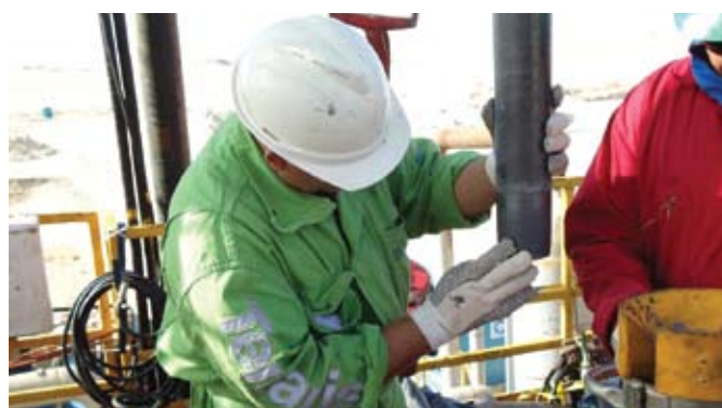
▲ Tenaris's local Technical Sales and Field Services teams participated in the project from the beginning.

While a number of standard Blue™ connections that had been unintentionally unprotected in the desert conditions suffered from pin corrosion problems, the Dopeless® version was found to be intact in every single joint. There were no make-up rejects and no reported sand contamination issues among Dopeless® connections. Also, considerable time saving was achieved.