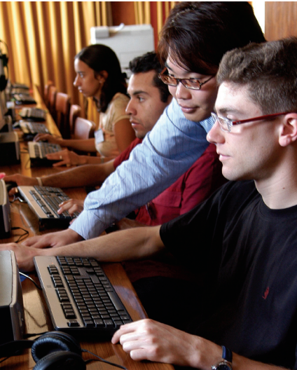
Tenaris is committed to education.

Among our five focus areas, Tenaris prioritizes its work in education, promoting the creation of knowledge as a strategy for the development and growth of both the company and the community.