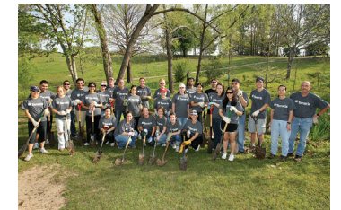
Promoting a corporate culture of volunteerism.

Tenaris encourages its employees to volunteer and give back to the local community. Our employees give their time, talent and energy to many worthwhile causes in the U.S. and around the world. We encourage volunteerism through company-sponsored events and on an individual basis.