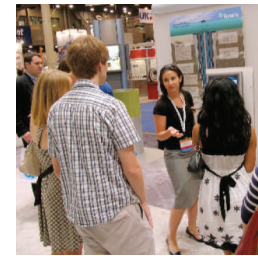
Mentoring and knowledge sharing opportunities for students.